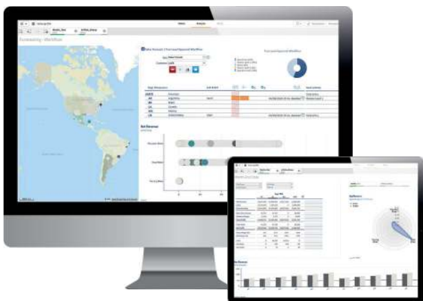
Fig #3: Sales Dashboard in Qlik®

Easily share plans, budgets, and forecasts with finance, human resources, marketing and other business functions without ever leaving Qlik®. Aligning sales planning with financial and operational plans empowers all functions to make connected decisions and manage performance more dynamically.