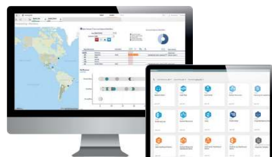
Fig #1: Jedox in Qlik®

The Jedox solution, connected to Qlik®, simplifies planning processes, integrates analytics and performance management, and unleashes more agility and efficiency throughout the business. Discover which operational drivers are directly connected to financial and business results and use insights from smart data analytics to make better decisions.