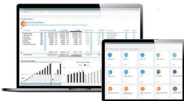
Fig #2: Finance Dashboard & Jedox Models

Update FP&A with the most current data from sales and other business functions and create driver-based analysis and what-if scenarios to provide better business decision-support.